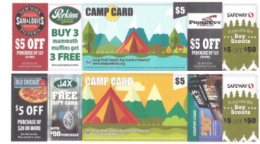
Spring Into Camp—Spring Fundraising Opportunity

Please Click Here for more information and RSVP